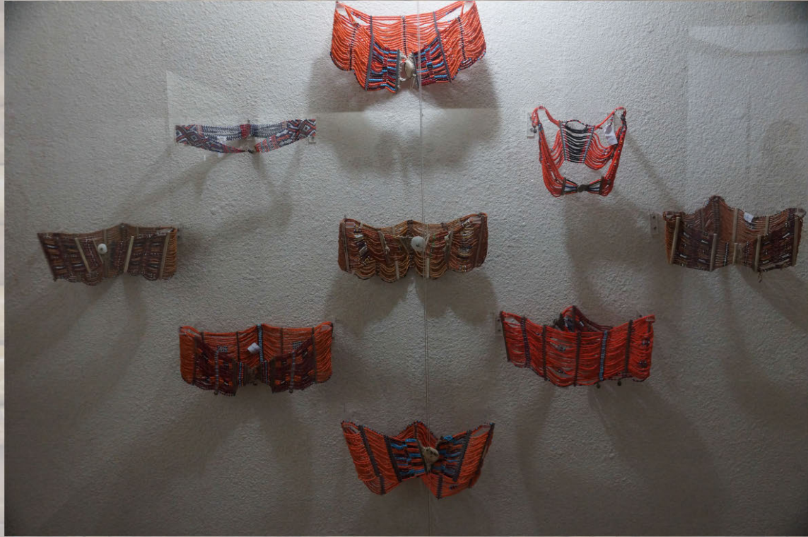
Beaded Girdle worn by rich konyak women