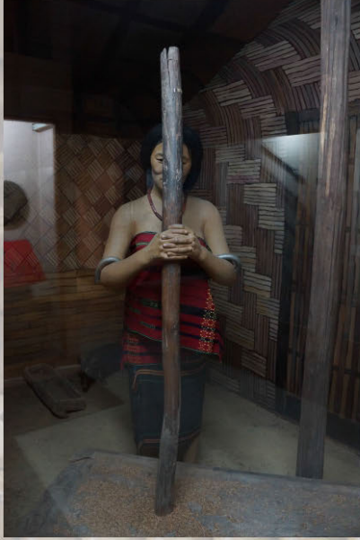
Tribe: Lotha Woman Husking Paddy