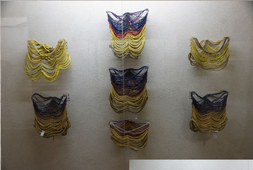
Name: Akichelochi prestigious beads girdle worn by rich women hailing from families who have done feasts of merit.