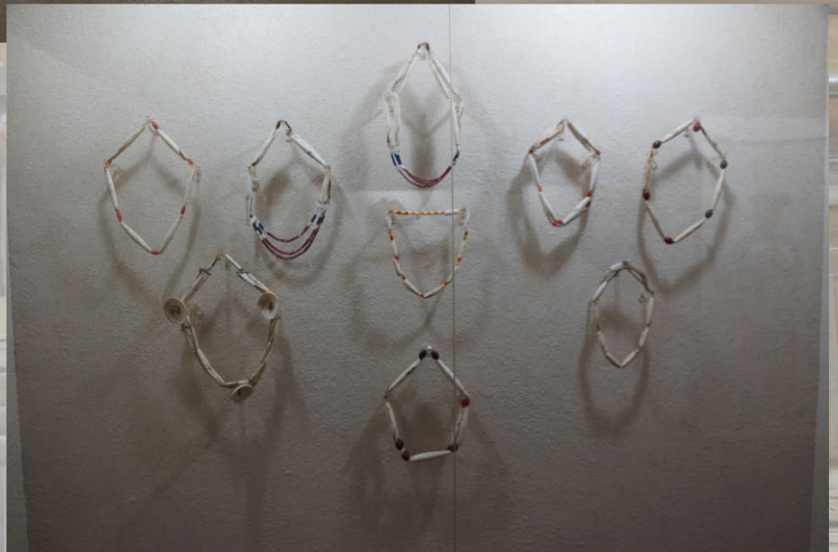
Necklaces made of conch shell, agate and beads were worn by menfolk of the AO of Tuensang district. The two in the centre most, were worn by womenfolk from Tuensang district.