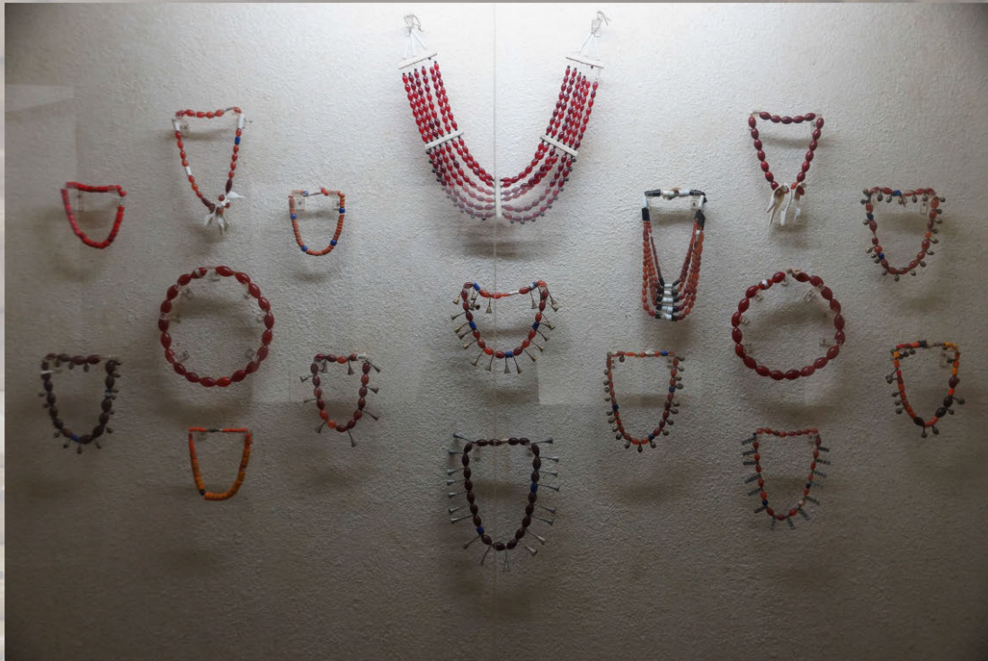
Female necklaces made of glass beads, agate and fluted brass beads worn by AO and the women from Tuensang District