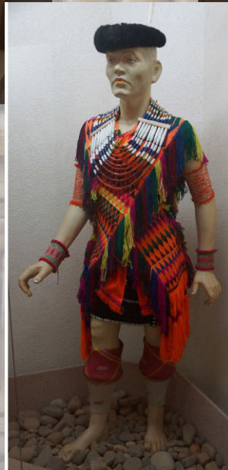
Chakhesang A Chakhesang folk dancer cum folk singer in his traditional outfit, sash and shin-guard were worn for festive occasions.