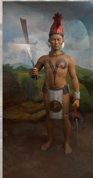
Tribe: Chang Warrior