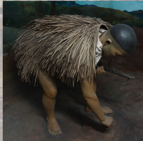
Tribe: Rengma Rainproof covering made of tatch