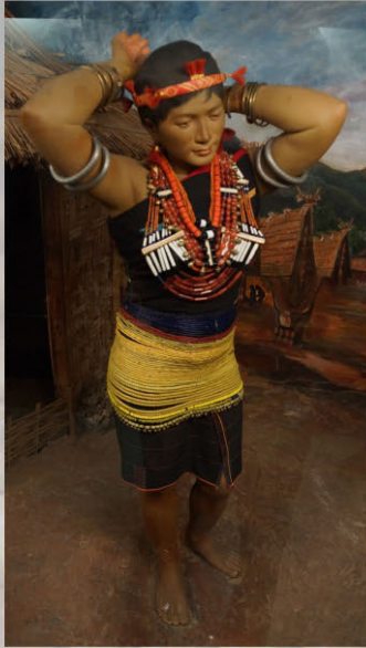
Tribe: Sumi The extra rows of beads in her girdle symbolizes her rich status