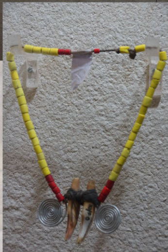
Naome (warrior pendants)