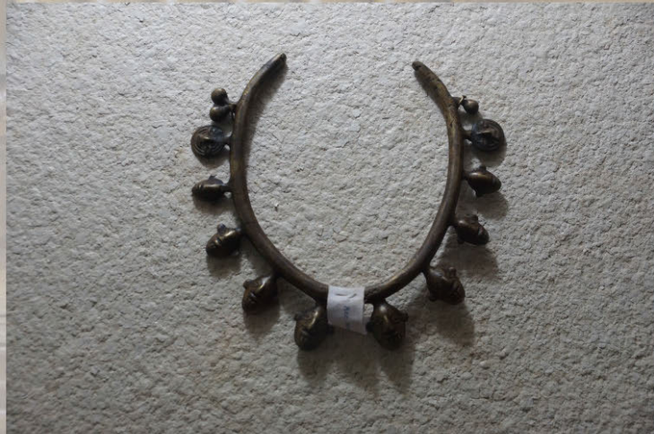
Brass - Choker worn by wealthy men and warriors of Chang community (Tuensang district)